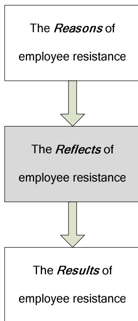
Figure 2. Reasons, reflects and results of employee resistance to change.

effects. But it is possible to reduce negative reflects by improving the leadership characteristics of a project manager.