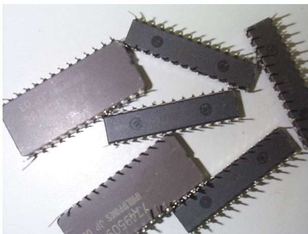
Figure 2. Integrated circuits (all applicances).