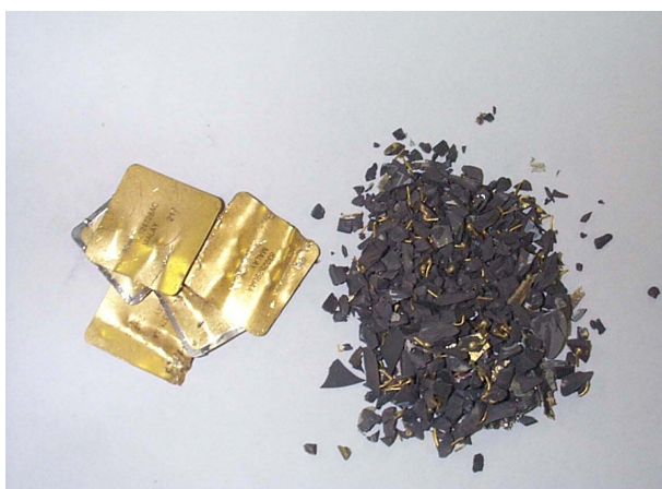
Figure 1. Computer Processors.

The weights of Computer-PCBs, Monitor-PCBs and