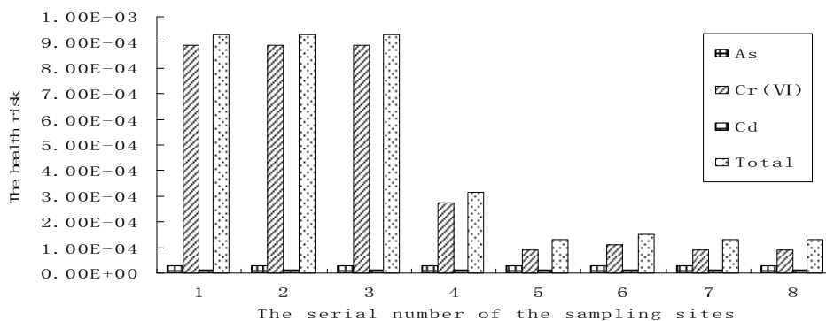
Figure 3. The average individual carcinogenesis annual risk of the carcinogens.

The average individual health hazard annual risk of the non-carcinogens can be seen in Figure 2. In the investigation area, the greatest risk value due to non-carcinogen pollutant is caused by fluoride (F), achieving 1.05 \times 10^{-8}/a . The ranking of risk value due to non-carcinogen pollutant by drinking water is Pb > \text{fluoride (F)} > Hg , within Pb accounting for 44.77%, fluoride (F) accounting for 34.30% and Hg accounting for 20.92%. The average risk values order of the 8 sampling points caused by the non-carcinogen pollutants is as follows: Number 2 > Number 4 > Number 8 > Number 5 > Number 7 > Number 6 > Number 3 = Number 1.