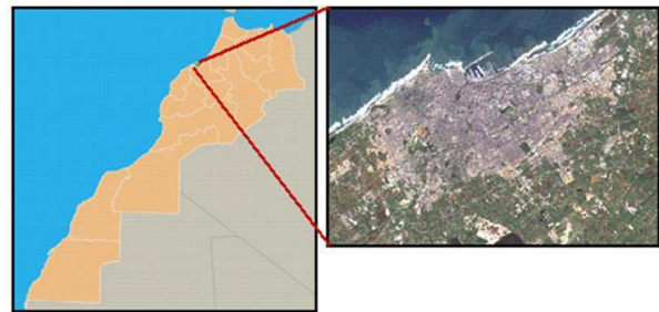
Figure 1. The study area location.