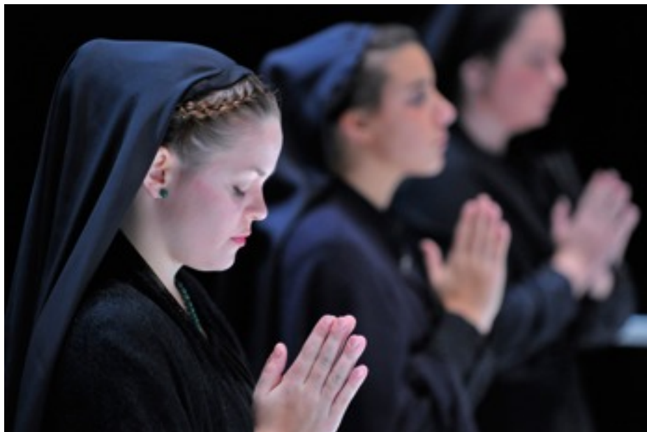
Figure Four: Adela in Prayer