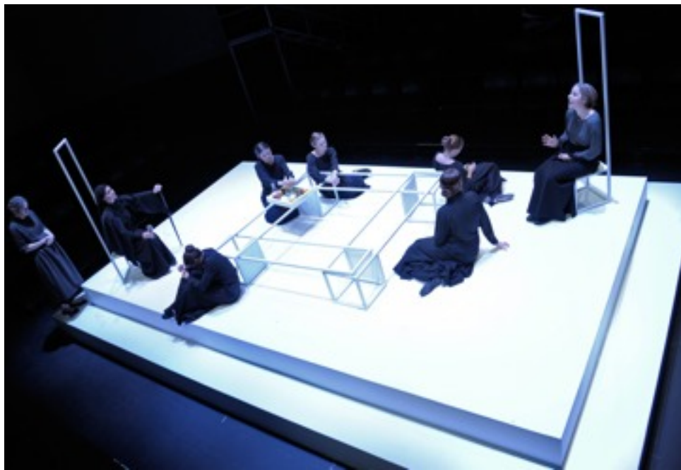
Figure Five: "Eating"

Inspired by this work, I developed a look for the top of each act: Act I would begin with the chairs on their sides, in a formation resembling a cross; for Act II, the chairs would be in a circle center stage, back-to-back; and for Act III, they would again be on their sides, but this time overlapping one another in a position reminiscent of a dinner table. These three looks corresponded to the pet titles I'd given the acts - the cross for "Mourning," the "Sewing" circle, and the table for "Eating." Not realizing quite how ambitious an idea it was, I proposed that the actors would move the chairs from one formation to the next over the course of each act.