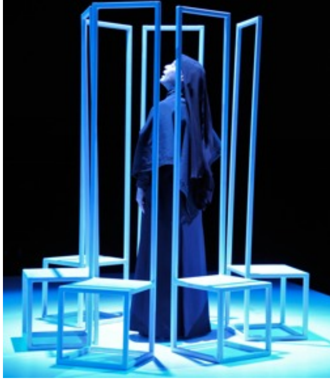
Figure Two: Bernarda in Repose

verging on the rapacious, even carnivorous - because she had so many other colors as well. (Berkman)