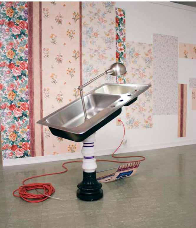
Figure 20: Installation shot showing While Realizing Our Full Potential with erected wall and wallpaper background