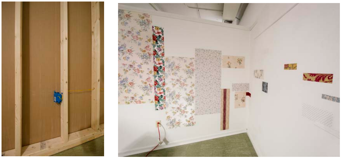
Figure 14: Detail of electrical box on back of wall Figure 15: Detail of wallpaper and molding

coverage reaches the corner, where gallery and erected wall meet, the strips become more fragmented. They become increasingly horizontally oriented and molding is situated within the composition, leading the eye around the corner and down toward the Rest Easy, We're Here (see Figure 19). The wallpaper and molding are addressed as both environmental attributes and objects of embellishment as the nature of their application to the walls change.