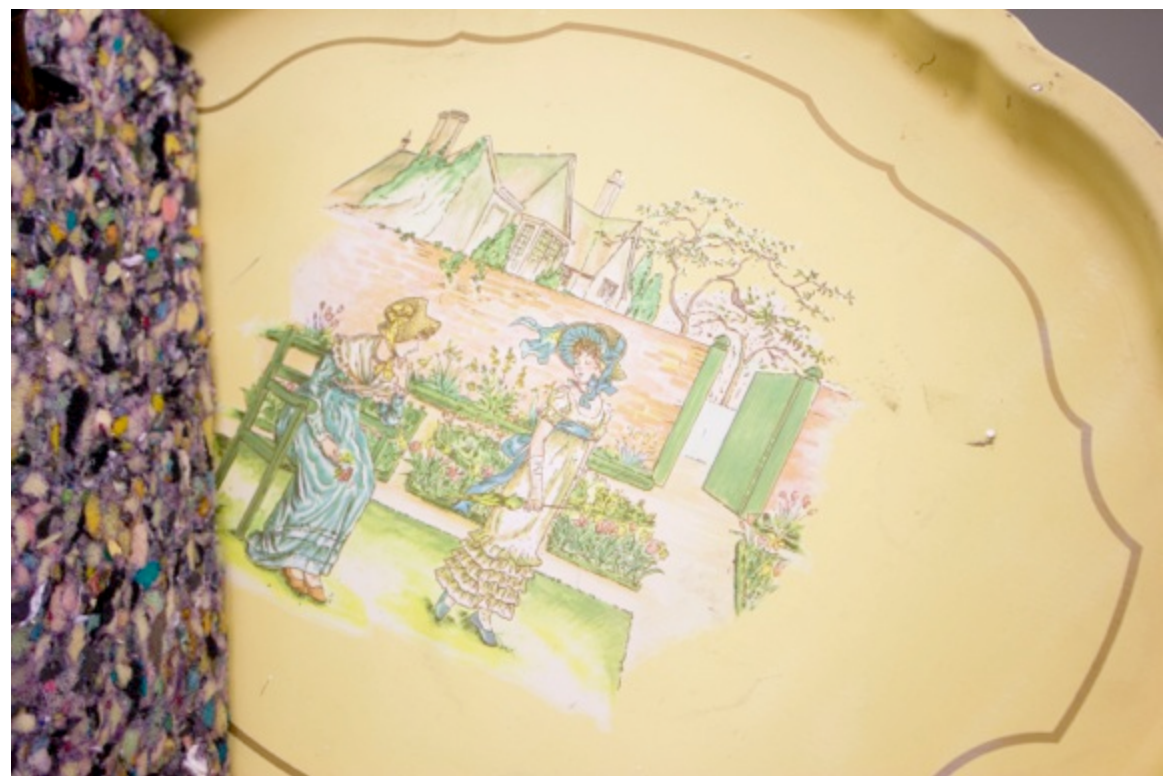
Figure 9: Detail of two Dutch girls in As We Continue to Move Forward

Connotations of the regional and economic lie beyond those of the visual. Raw materials are almost always acquired through commercial means: big box stores selling all the unitized materials as if they grew right there in the store. The regional origin of lumber products does not concern the average consumer. Thus, raw materials are seen as just that: raw, without a history prior to the shelf.