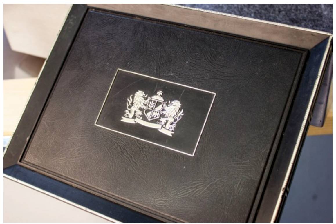
Figure 8: Detail of English cote of arms in Liner Progression of Fork, Amazon Box and Cigar Case

The motifs are printed or embossed on imitations of rare crafted objects using cheap, moldable materials. A leather skinned cigar box with the English coat of arms embossed on the top could be seen as an object displaying sophistication in taste and class. But to reproduce that object in black plastic with gold paint alters the significance of the original. The object in reference becomes nothing more than an image of the original display of affluence and privilege. These reproductions are the image "that exists after the object", in the same manner as a photograph records only the imagined object and cannot account for its totality. <sup>23</sup> Every nostalgic motif is a reproduction of the original aesthetic statement. These moments reoccur throughout the work, evoking an awareness of our tendency to appropriate a visual