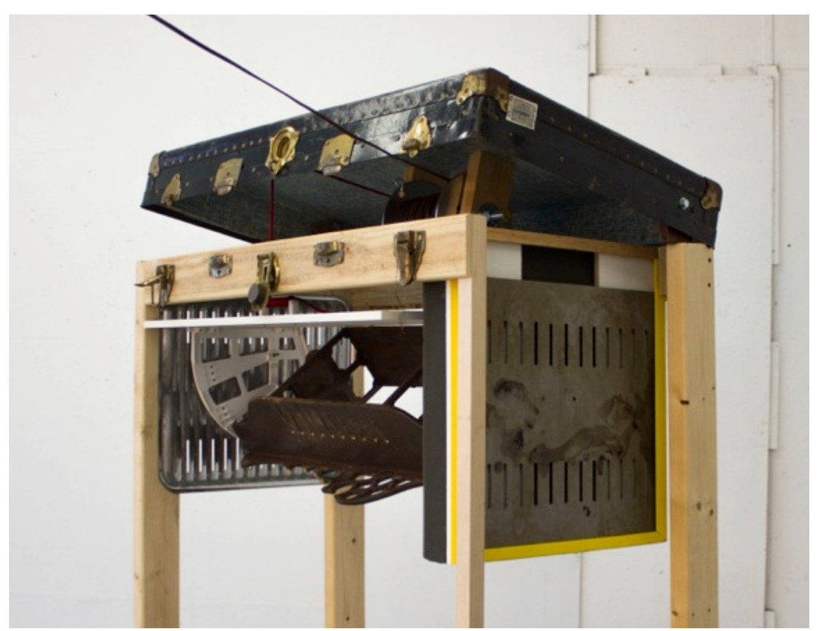
Figure 16: Detail of Linear Progression of Chest, Shoe Organizer, Shelf, Broiler Pan and Napkin Rings

A methodology derived out of naiveté and incomprehension, is visibly displayed in the objects through these moments of superfluous and aesthetically driven labor. Again, this alludes to a culture of environmental disengagement via inappropriate material/object applications.