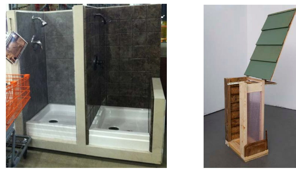
Figure 12 (left): Image of Home Depot displays of compressed shower units. Figure 13 (right): Linear Progression of Siding, Spindles, Joist, Cutting Board, and Table Leg

Siding, Spindles, Joist, Cutting Board, and Table Leg is compartmentalized space. It is folded up and transported easily and upon display, opens and functions synonymously. The display function is all that is required for our imaginations to sweep us away, into a dream of the home we covet.