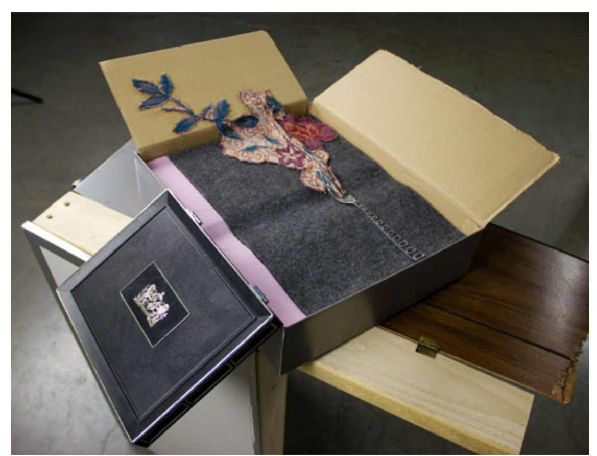
Figure 7: Linear Progression of Fork, Amazon Box, and Cigar Case

provide stability to the home, are covered over with appliques and soft materials that connote a female presence.