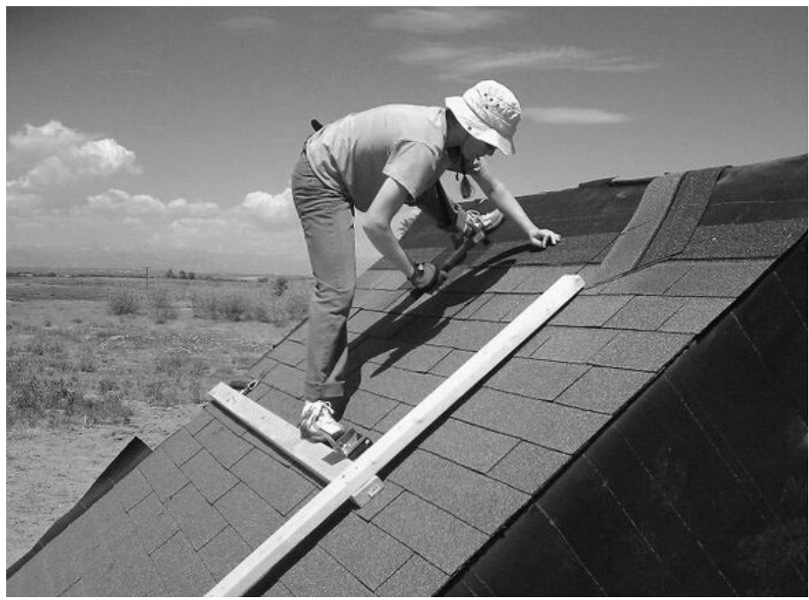
Figure 22: The Artist at work