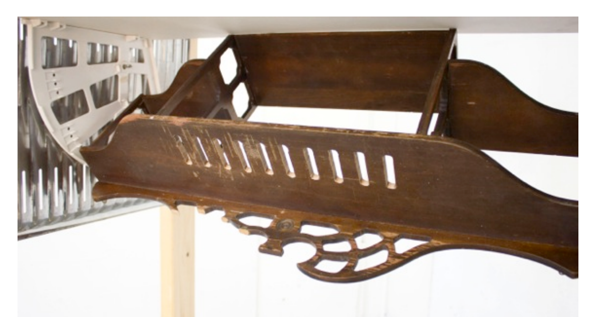
Figure 2: Detail image of Linear Progression of Chest, Shoe Organizer, Shelf, Napkin Rings, and Broiler Pan showing a failed lamination

which is no longer highly desirable or fashionable. The cultural identity of the shelf signals that of detritus. Further evidence of its state of detrition is evident within a missing section of the ornament at the top of the shelf. The ornament has been fractured in a clean straight line, revealing its assembly process with a failed lamination.