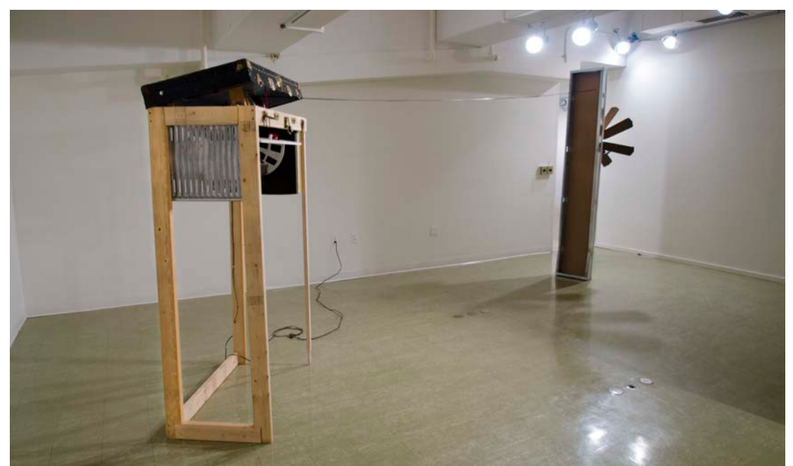
Figure 17: Installation shot of East side of gallery