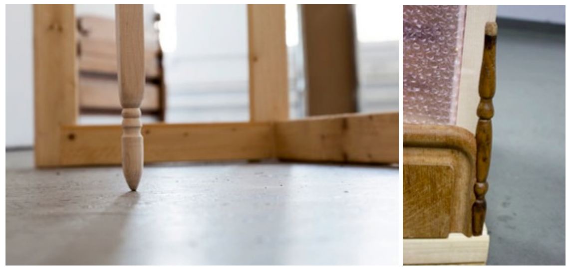
Figure 3 (left): Detail of Linear Progression of Chest, Shoe Organizer, Shelf, Napkin Rings, and Broiler Pan showing lathed section of maple leg

The fabrication of these works is driven by a survivalist mentality; made with rudimentary carpentry skills and referencing specific crafting techniques. Objects are retro-fitted to nest within and adjacent to other objects, trimmed out, cut in half, and disassembled to make way for their companion objects in the construction of the whole. Raw materials are cut and formed to match the size and shape of the objects detritus. Complex joints are fashioned and techniques exploited to resemble crafted objects. Allusions to the carpenter's hand appear in the armature of the sculptures.