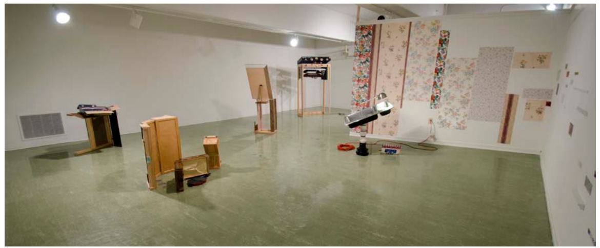
Figure 18: Installation shot from Southwest corner of gallery