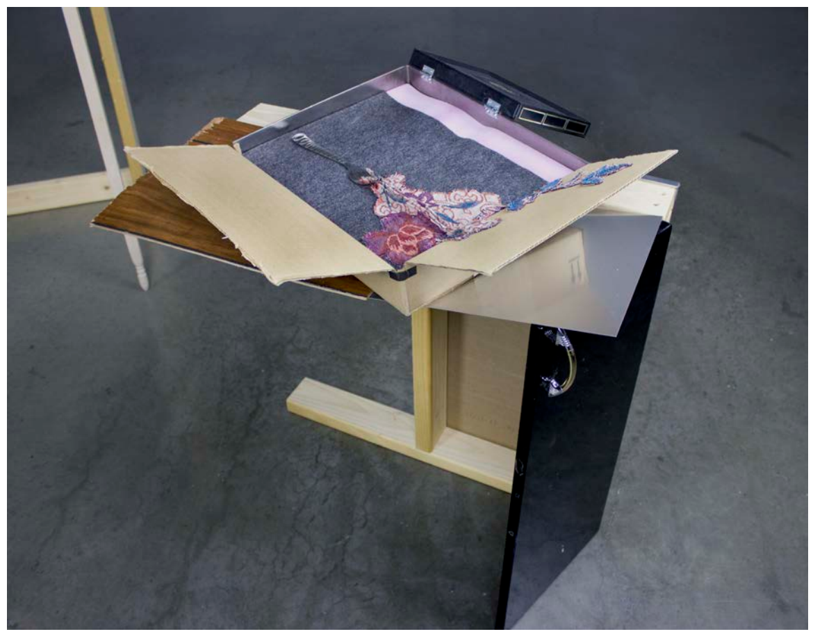
Figure 11: Linear Progression of Fork Amazon Box and Cigar Case on Conglomerate Pedestal

Motifs that show up superimpose sentiments of historical appropriation over tenuous constructions. These motifs act as stand-ins for what would result from intimate relationships with materials and objects, developed over time. In this respect, consumerist objects are representational of the site of the home rather than specific, as Smithson's transported earthworks are. Surrounded by representations of domesticity, we are living in our own abstract environments. Our environments are further abstracted by the invisibility of the raw materials used to construct our spaces. Continuing previous discussion about the displacement of materials, the contracted home retains little connection between the site and its material specificity. As we enter the home, we are inserted into two centuries of