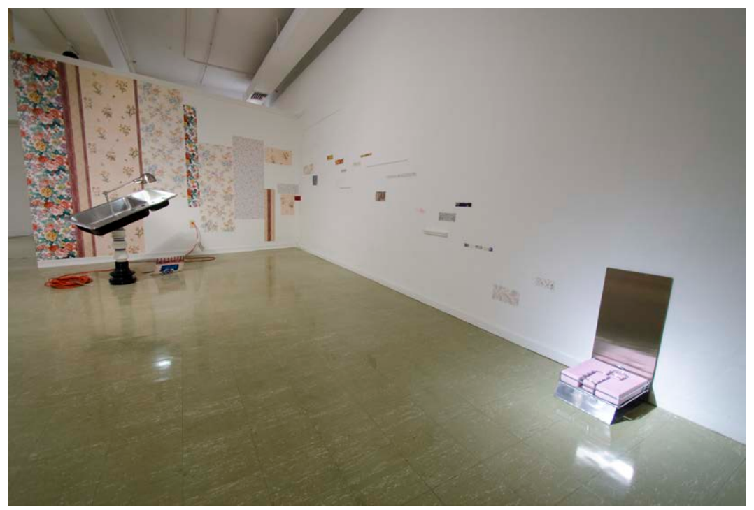
Figure 19: Installation shot from West side of gallery, picturing While Realizing Our Full Potential and Rest Easy, We're Here situation within erected wall and wallpaper installation