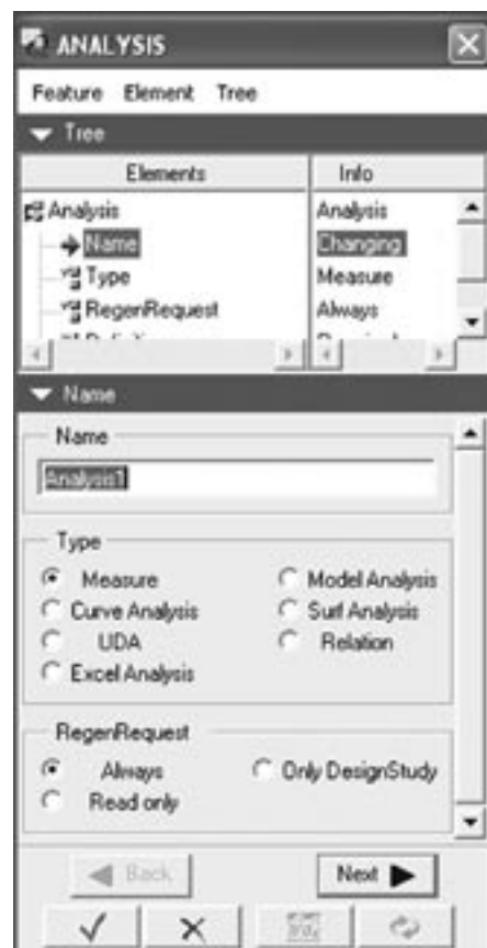
Fig. 1. Screen dump of Analysis element

and parameters it is possible to use these methods in some detail for implementation of analytic dependence into model analysis. Using user defined analysis it is possible to create elements driven by specific parameter, which can be used repeatedly on other models. Modeling conditioned by behav-