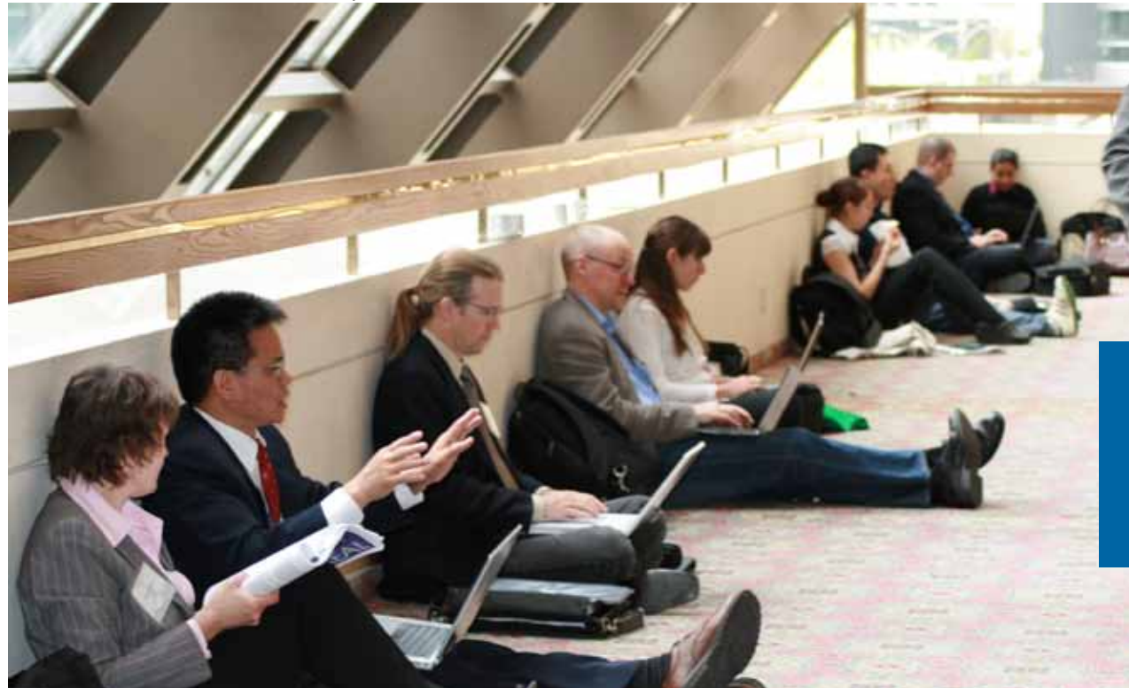
2008 Conference attendees take a moment to 'catch up.'

ICA is well positioned to take a lead international position on communication research in collaboration with corporate, government and aid organisations around the world. ICA could champion this longer term goal for building and identifying communication research collaboration. There appears to be ample demand for high level communication research to address some important social and economic programs, especially in the Asia and African region where coordination of these schemes is developmental.