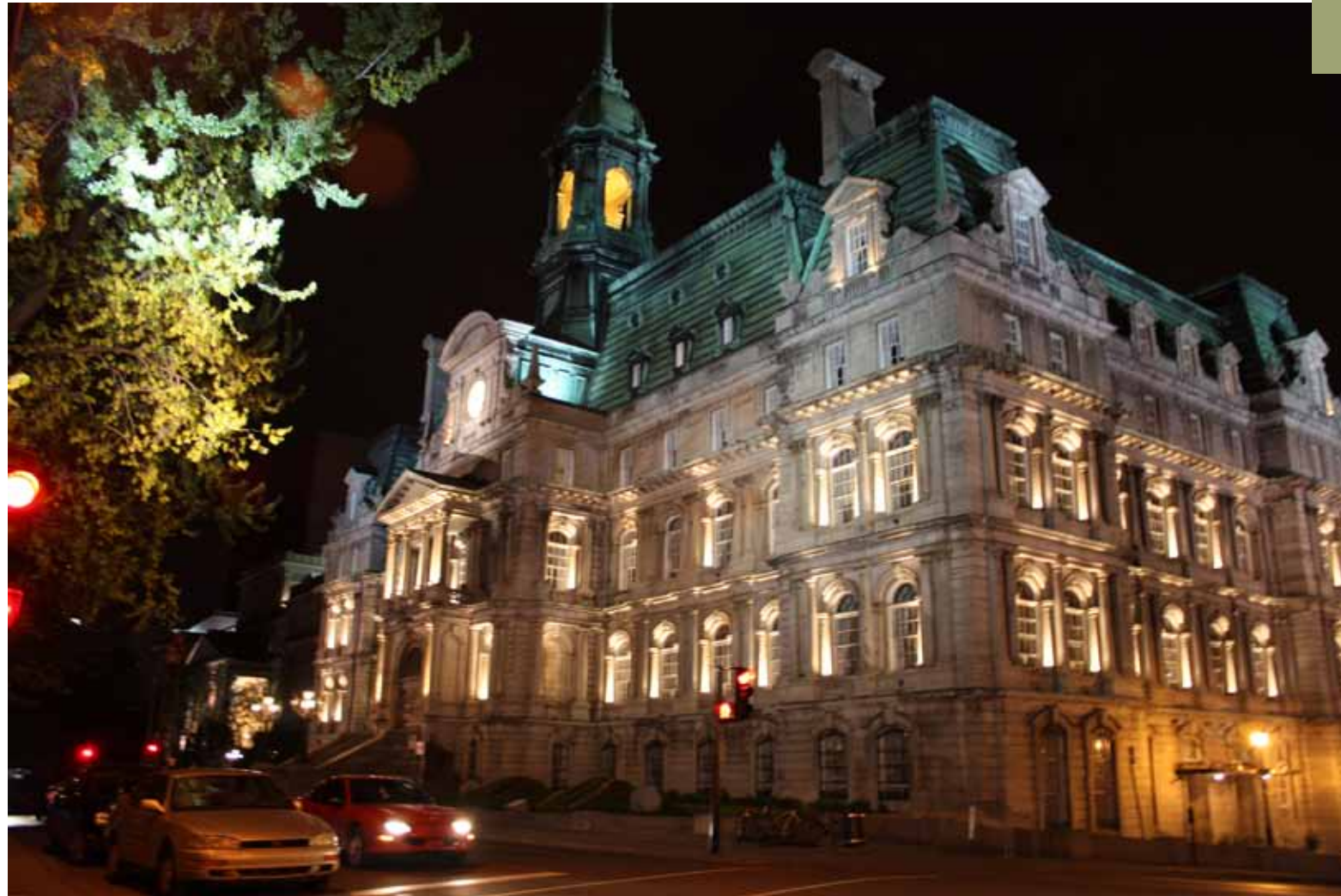
Old Courthouse, Montreal