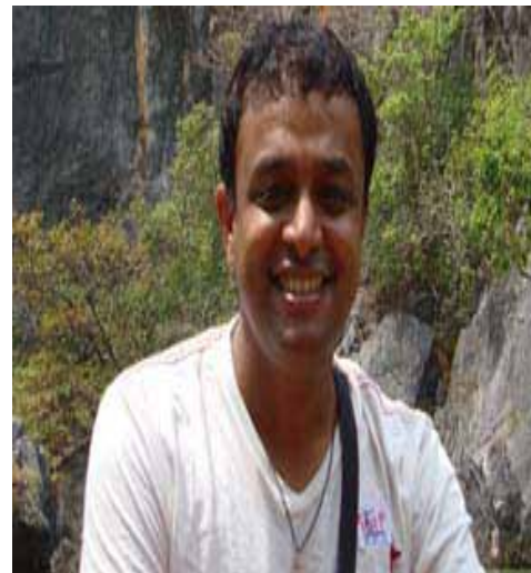
Report prepared by Mohan Jyoti Dutta

internationalizing ICA journals and conference, such as (a) providing guidance regarding where to submit manuscripts, (b) actively recruiting regional board members to serve as liaison with the publications committee and journal editors not only in disseminating information to potential authors, but also