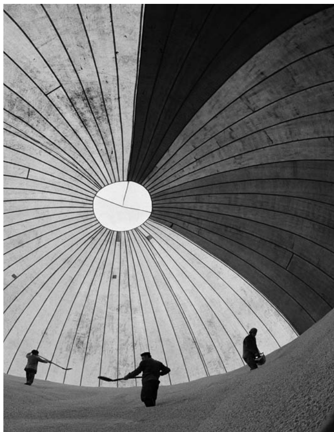
Title: Storage of cereal under foil tent EU-OSHA Photo Competition 2009