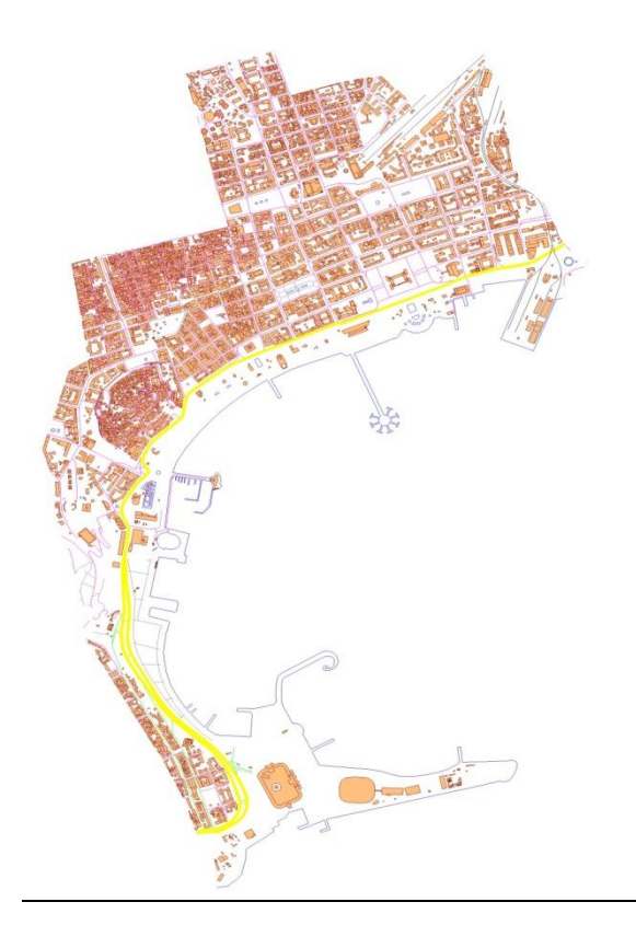
Figure 3. The selection of clutter classes.