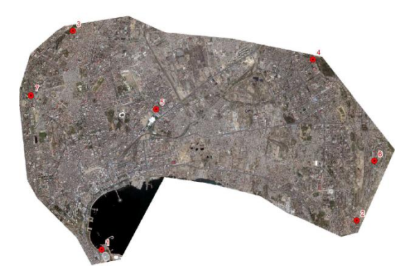
Figure 1. The placement scheme of GPS points

There is shown the placement scheme of GPS points concerning Baku city project in the figure 1.