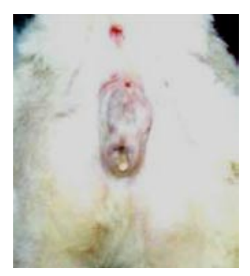
Figure 8. Castrated male cat appearance of the patient whose sutures were removed 10 days after surgery