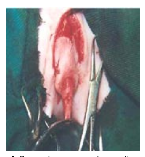
Figure 2. Castrated appearance of a sexually active cat