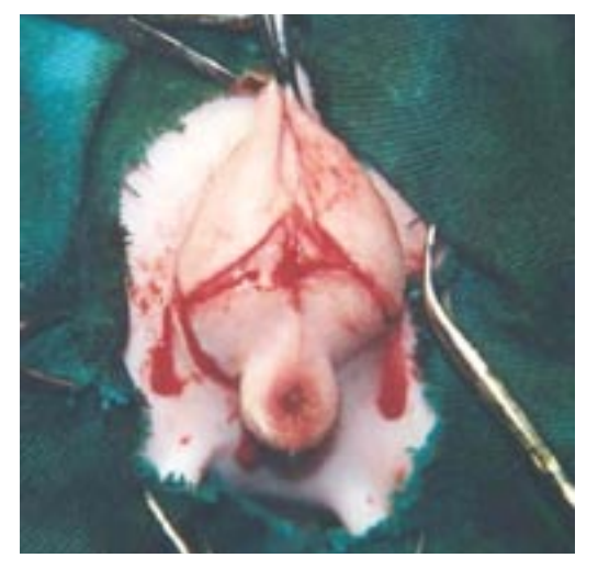
Figure 1. Appearance of the eliptical incision including the scrotum and the perineal region

In a study they published in 2000, Yeh and Chin described a modified perineal urethrostomy technique using the prepuce mucosa. They reported uncomplicated recovery in all cases where they used this technique in 14 cats with urethral obstruction. Advantages of this technique are; return to urination shortly after the operation, better urination potential compared to normal cats, a more aesthetic post-operative appearance of the region compared