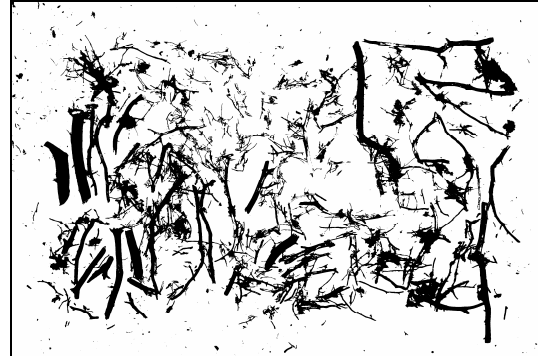
Figure 1. Example of branch photography.

needles, twigs, and coarser branches for detailed measurements of hemisurface areas and clumping factors, mainly by photographing techniques (Fig. 1). From the total area, the area fraction of branches and stems, i.e., woody area, was calculated. Also, the woody area was modelled as a function of single-tree measurements, such as tree height and crown width. Such variables might be derived from single-tree segmentation algorithms using LIDAR data.