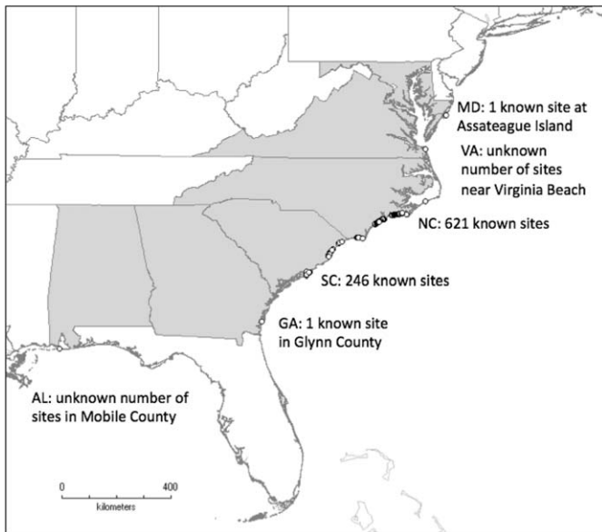
Figure 2. Known distribution of beach vitex ( Vitex rotundifolia L.) in the southeastern United States.

et al. 1999). Globally, according to the Köppen-Geiger climate classification (Peel et al. 2007), beach vitex is known to exist in a host of climatic regions, including three of the six major groups: tropical (specifically, Af, Am, and Aw), temperate (Cfa and Csa), and continental (Dfa and Dwa). It is evergreen in tropical areas, such as Hawaii and deciduous in temperate areas along the coasts of Korea and North America.