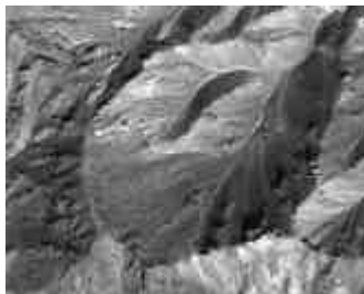
Figure 2: Digitized aerial image

One black and white aerial image with an image scale of approximately 1:40000 of poorly texture area in Iran was used(fig.2). The image was digitized using photogrammetric scanner with a pixel size of 14 \mu m, resulting in a ground sample resolution of about 0.56m. The interior and exterior orientation were determined using digital stereo plotter. The illumination direction was calculated from known time of the image acquisition and geographical coordinates of surface area. The maximum height difference within the chosen test area is about 50m.