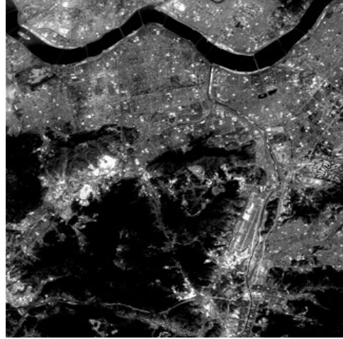
Figure 2. KOMPSAT-1 EOC scene of Seoul

acquired 144(12×12) image grid points equally in the entire scene. In addition, 41 evaluation layers(3840000m~3860000m from equator) were applied uniformly to each image grid point. Therefore, total 5904 points were used as the corresponding points. Furthermore, 100 check points were extracted randomly at the target virtual space to estimate the accuracy.