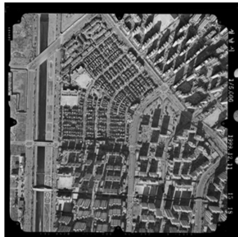
Figure 2. Aerial photograph of Sungnam In this data, a total 4464 corresponding points were extracted.