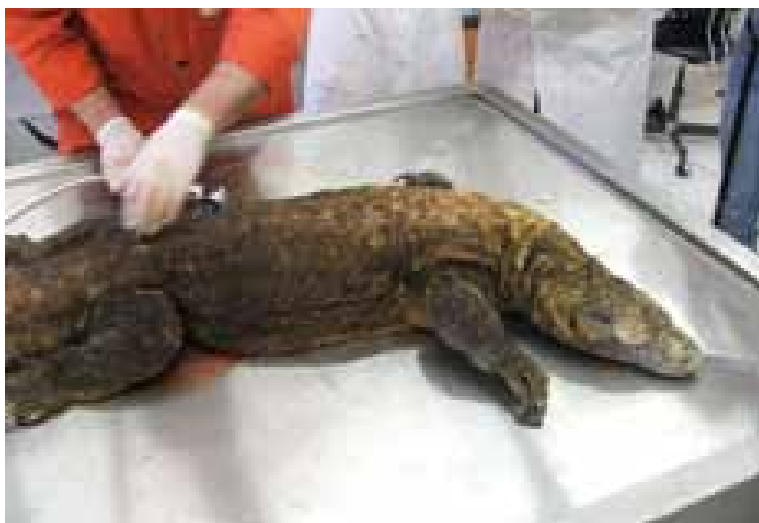
Figure 4. Female Komodo dragon ( Varanus komodoensis ) before necropsy

in the granulomas. Diffuse glomerulonephritis with urate granulomas in the cortex and medulla were found in the kidneys. Diffuse non-specific granulomatous splenitis with occasional urate granulomas was observed. In the liver dystrophic vacuolar changes with hepatocytes containing large lipid droplets (fatty liver degeneration) were seen. ZN staining was negative in the case of the kidneys, spleen and liver. Microscopically, no other organs exhibited pathological lesions (except for the hyperaemia of organs) and ZN staining was negative in all these tissue sections. The formalin-fixed paraffin-embedded tongue tissue section was then further analysed. The tissue section was deparaffinised in xylene and subjected to DNA isolation according to a procedure described previously (Slana et al. 2010). The presence of mycobacterial DNA in the tongue tissue was proven by two independent conventional