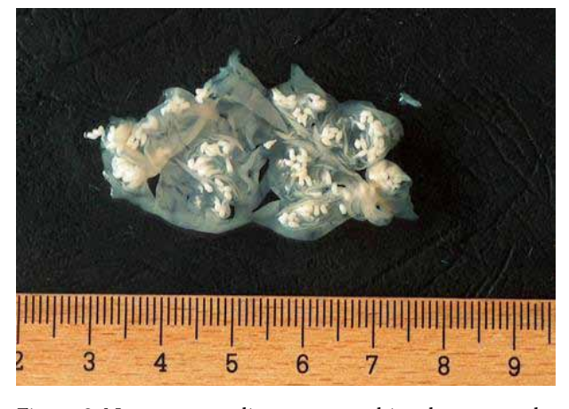
Figure 3. Numerous scolices seen as white clusters on the internal layer of the cyst

Although bovine and caprine Coenurosis caused by T. multiceps is referred to in the parasitological text book the occurence of T. multiceps in goats and cattle is less common than in sheep (Soulsby