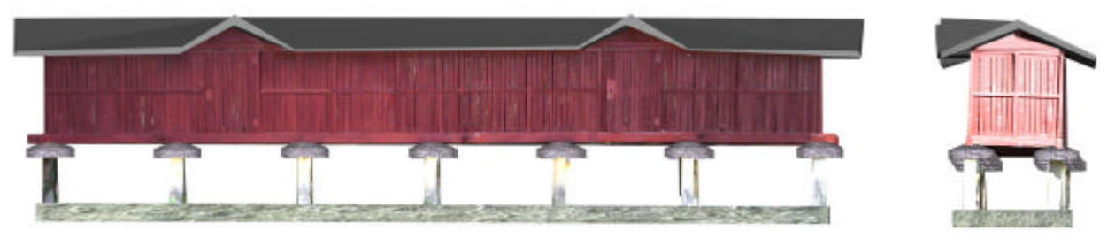
Figure 3. Rendering with photo-realistic textures

Different renderings of photo-realistic textures, have been obtained from the three-dimensional surface model, such as those seen in Figure 3. These textures have been applied from photographic shots of the object itself.