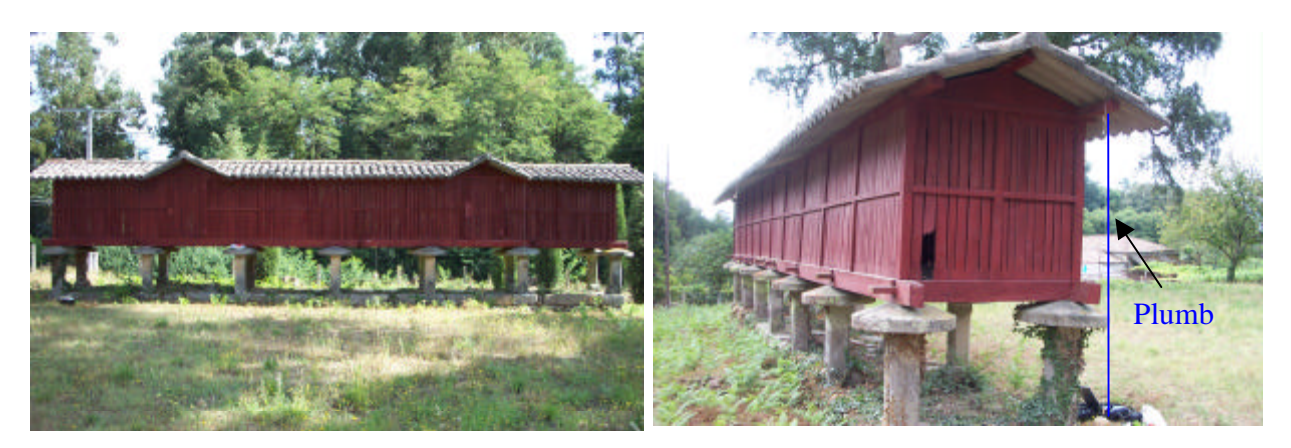
Figure 1. Example of the photographic shots. In the image on the right the direction of z axis defined by the plumb line can be seen.

2.1.2. Laboratory work: Once field work has been finalised, laboratory work begins, proceeding with the analysis and processing of the information collected. With this information saved and classified two different alternatives are raised. The information can either be filed away until the need arises to process it, or it can be immediately processed, resulting in 3D models of the original structure. In order to reach this objective it will be necessary to resort to the photogrammetric stations. Due to the characteristics and aims of this work, the use of Digital Monoscopic Photogrametric Systems are recommended. A series of successive steps will be carried out when processing this data, as is briefly stated below: