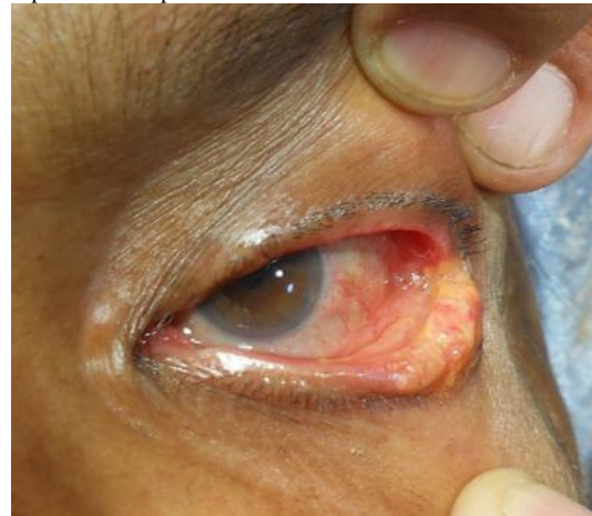
Fig 1: Left lower eye lid mass lesion

infiltration. A full thickness excision with 5mm of clinically normal tissue was performed. A semilunar flap was raised temporal with concavity inferiorly and edges were sutured. The excised tissue was sent for histopathological examination. Sections showed tumor arising from the epidermis and infiltrating dermis in nests of folliculocentric pattern. The cells had vacuolated cytoplasm and moderately pleomorphic hyperchromatic nuclei suggestive of sebaceous carcinoma [Fig 2]. She was followed up. One month later, the flap was taken up well and there was no recurrence.