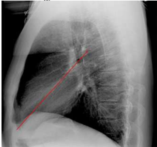
Fig 2: Alignment of cardiac valves on lateral chest X ray Diagnosis for Mitral annular calcification can be done by chest X-ray and echocardiography. Chest X-ray (CXR) can detect mitral annular calcification. Calcification of mitral annulus in the chest X-ray generally follows the C-shape of the mitral annulus.(3) Location of cardiac valves is best determined on the lateral CXR. Draw an imaginary line from the apex of the heart to the hilum. The pulmonary & aortic valves generally are above this line and the tricuspid & mitral valves are below this line (Fig-2).

Mitral annular calcification is most commonly identified by echocardiography as an echo dense shelf-like structure involving the mitral valve annulus with associated acoustic shadowing. The calcification frequently has an irregular, lumpy appearance.(2,3) Although mitral valve leaflets and chordae tendinae are generally not involved, calcification may progressively accumulate in the subvalvular region beneath the posterior leaflet with encroachment on the leaflet. Sparing of the leaflet commissures and anterior leaflet distinguishes mitral annular calcification from rheumatic mitral involvement.(2)