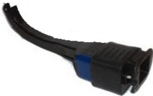
Figure 3: (A) Photo of the disposable Airtraq device.

The light is battery powered and the battery box is located in the main body of the Airtraq device. There are two sizes selected depending on patient weight and size of ETT to be used; regular size - maximum blade thickness of 17.5 mm (ETT 7.0-8.5) and small – maximum blade thickness of 15.5mm (ETT 6.0-7.5), (Figure 3A, 3B). Two further Airtraq versions now exist for nasotracheal and double lumen endobronchial intubations.