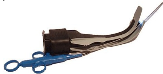
Figure 4: Photo demonstrating the Airtraq device with the use of a flexible biopsy forcep guided through the intubation channel for the proposed purpose of foreign body removal and biopsies

The use of the Airtraq device in Laryngology maybe relevant for the difficult to intubate patient as the hypopharyngeal/laryngeal view is similar to that obtained with a direct laryngoscope with the additional advantage of less airway manipulation whilst primarily being used as an intubating tool. To expose the glottis the device can either be located at the vallecular or under the epiglottis. Biopsies of relevant areas could also be taken, which is more feasible with shorter versions of flexible biopsy forceps (e.g those used for bronchoscopy), in order to follow the exaggerated curvature of the laryngoscope (Figure 4). There does not appear to be a suitably curved rigid instrument at present.