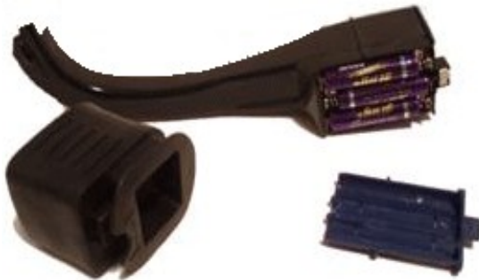
Figure 3: (B) Photo demonstrating the detachable view finder and battery pack.

There is an anti-fog system and an available clip-on video system to allow viewing on to a monitor with a recording facility.