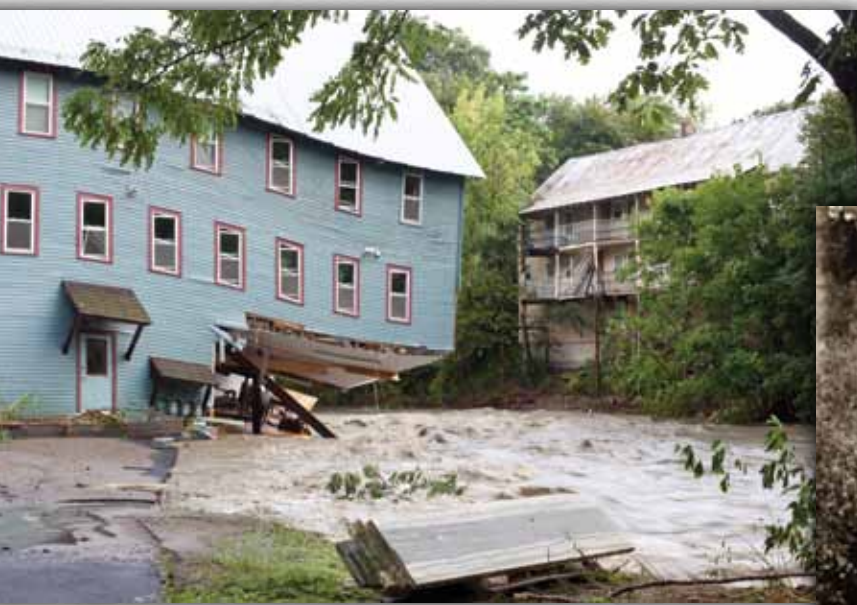
LEFT | Whetstone Studio's building partially swept away as Whetstone Brook overflows its banks. BELOW | Comparison historical photograph of Whetstone Brook from the mid-1900s.

"Flooding in places like Brattleboro is often linked with the intense rains of hurricanes or