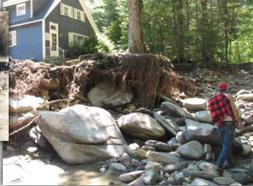
ABOVE | Flooding near the Branch School House in 1936. RIGHT | Comparison view of the former Branch School House after Irene flooding in 2011.