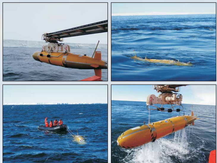
Figure 2. Launch (upper panels) and recovery (lower panels) of Autosub3 during the January 2009 operations in Pine Island Bay. The sub is 7 m long, 0.9 m in diameter, and powered by 5,000 alkaline D cells. A VHF link between ship and sub enables remote download of data and upload of mission scripts, so that recovery is only necessary for adjustment of sensors or replacement of batteries.