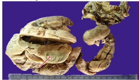
Figure 1: Photograph showing segment of small intestine with an adjacent greywhite mass

Multiple sections from the mass showed extensive areas of necrosis, sheets of mixed inflammatory cells and many multinucleated giant cells. Amidst these are seen numerous trophozoites.(Figure2) These trophozoites resembled large histiocytes with granular cytoplasm and inconspicuous nuclei. These were confirmed by PAS stain and iron hemotoxylin and eosin stains.(Figure3)