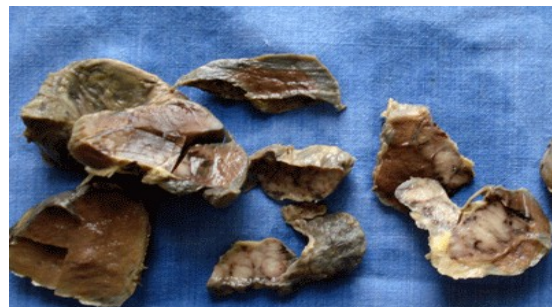
Figure 1: Cut section of the masses revealing hemorrhagic and grey white areas.

Microscopic examination of the masses showed a well delineated tumor, predominantly composed of capillary sized blood vessels lined by plump endothelial cells, along with few cavernous spaces filled with blood (Figure 2). The vascular spaces are separated by fibrous stroma. The stroma also showed extensive areas of ischemic necrosis and myxoid degeneration. These features were diagnostic of choriangioma of placenta with secondary degenerative changes and infarction.