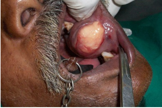
Figure 2: Intraoperative.