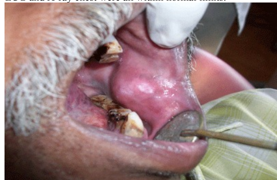
Figure 1: Preoperative showing large mass on the buccal mucosa

A 60 – year old male complained of a left – sided swelling in the buccal mucosa. The lesion had appeared 10 years previously, growing very slowly and without any accompanying symptoms of oral intake or speech. Oral examination revealed non – tender, large, well demarcated, smooth, sessile with soft to firm mass of size 3 X 3 cm protruding from the left buccal mucosa. The overlying mucosa appeared normal (Figure 1). There was no palpable cervical lymphadenopathy. Medical history of the patient was non contributory. Routine hemogram, ECG and X-ray chest were all within normal limits.