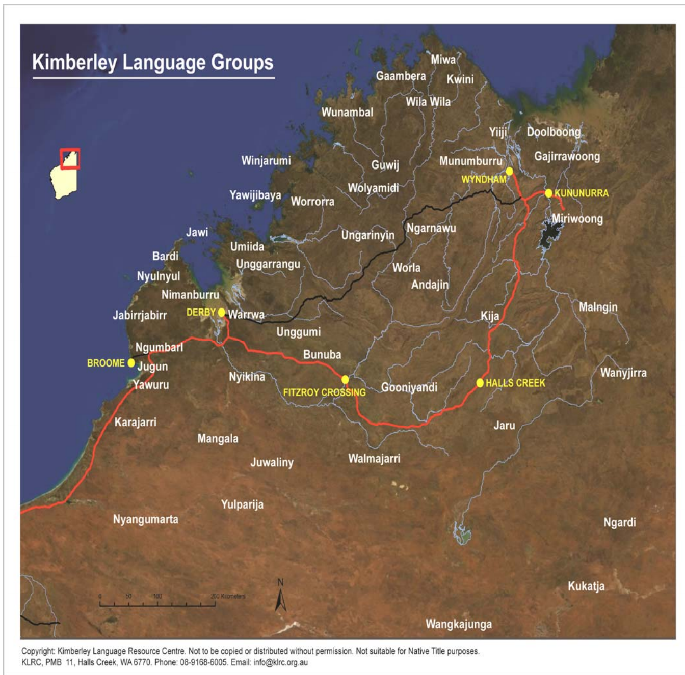
Figure 1. Kimberley Language Groups.

beings, and their interaction with the land and natural environment. Traditional owners recognise knowledge is transmitted through language and binds places, people, and kinship systems that form the foundation for social organisation together. Language should be the first and most important consideration for people when caring for their country. Without language, there are no true meanings.