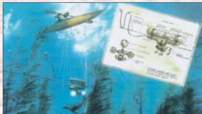
Artist's rendition of Orpheus, deployed in Monterey Bay National Marine Sanctuary.