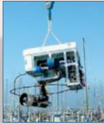
Orpheus deployment in Monterey Bay National Marine Sanctuary.