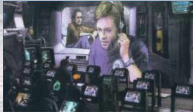
Artist's rendition of audience members at Mystic Aquarium's "Immersion Theater" in Mystic, Connecticut, watch a live expedition from a national marine sanctuary.