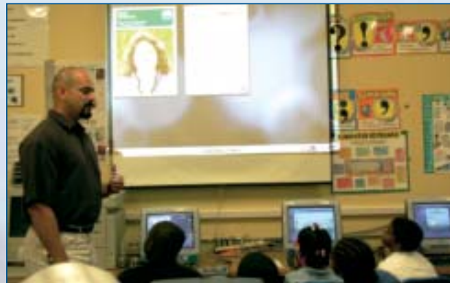
Students at the Empire CompuTech Center, K-8 school in the Cleveland Municipal School District, explore the COOL Cards on the COOL Classroom at www.coolclassroom.org .

Classroom projects that infuse technology, like COOL Classroom can only be effective in the