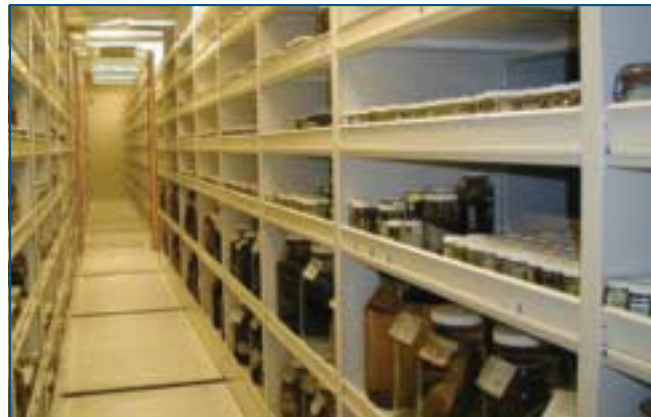
Figure 2. Compacterized shelving in the newly outfitted Marine Vertebrates Collection in Vaughan Hall, 2002.

Scripps, one of the first U.S. institutions to undertake large-scale collection of sediment cores, has historically been a leader in core curation. The Cored Sediments and Microfossil Collections contain samples from as early as 1916. William R. Riedel became the first curator of Geological Collections in 1955. He began to gather private collections, dating back to the early 1900s, and created a cohesive, well-documented collection that has continued to the present day. Today, the Cored