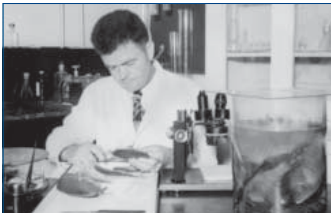
Figure 4. Carl L. Hubbs, an avid, tireless collector, at work in his laboratory in the late 1940s.

fundamental geophysical and geochemical processes that have shaped the ocean basins.