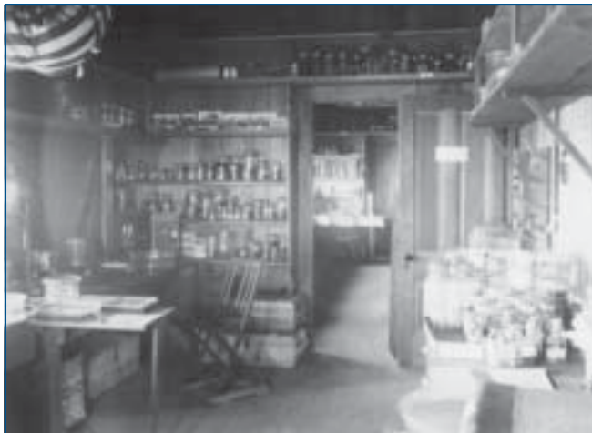
Figure 1. Specimens in the “Little Green Lab” located at La Jolla Cove, circa 1907.