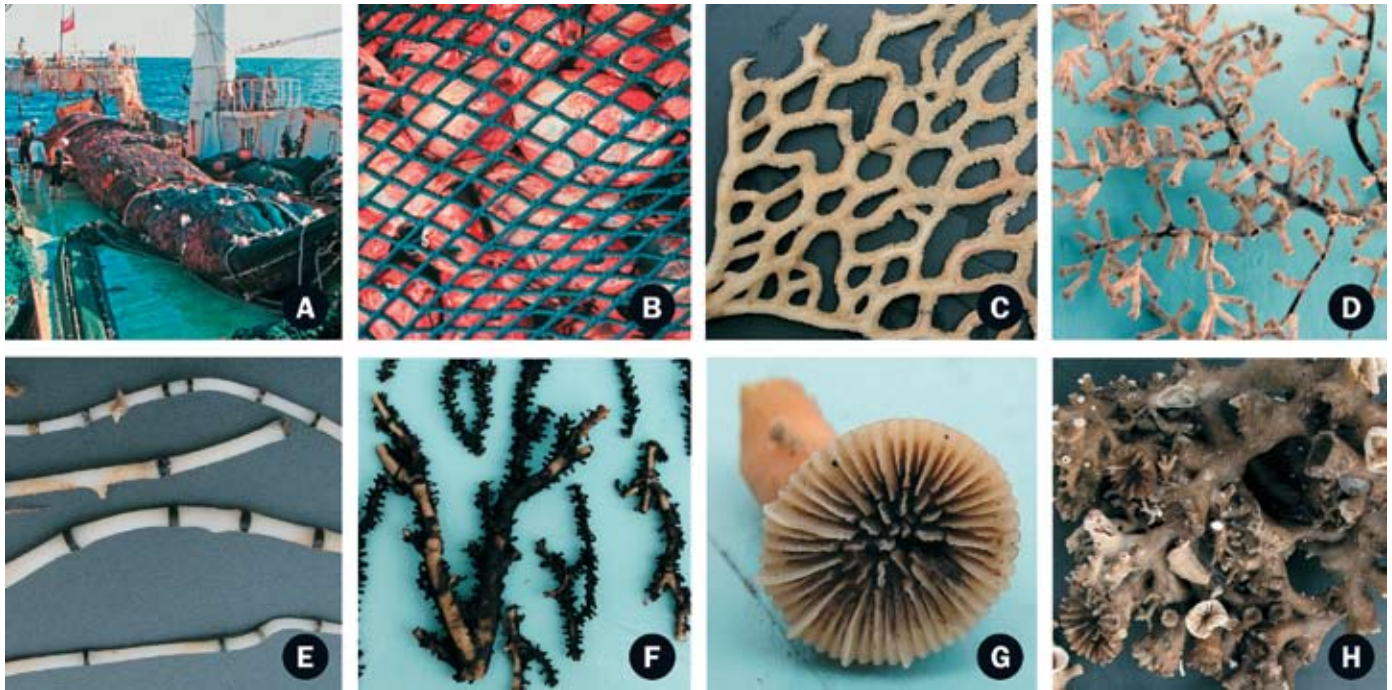
Figure 2. (A, B) Orange roughy aggregations caught during a bottom trawl experiment conducted on Sedlo Seamount in 2001, and some of the bycatch benthic fauna, including (C) a sponge, (D) a gorgonian, (E, F) bamboo, and (G,H) scleractinian corals.

indicated by the actual measurements of primary production and organic material in the water column (Morato et al., 2009). EC regulations protect Sedlo from bottom trawls, gillnets, entangling nets, and trammel nets. In 2007, Sedlo was proposed by Portugal for the OSPAR (the current legal instrument guiding international cooperation on the protection of the marine environment of the Northeast Atlantic) network of Marine Protected Areas (MPA), and was accepted by the parties in 2008. The process of designating Sedlo as an MPA under Portuguese/Azorean law is ongoing, with a management