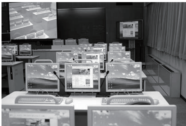
Figure 3. Overview of computer room

In classrooms and computer rooms, this system can record lectures synchronizing images of classroom and content such as Microsoft PowerPoint slide, and students can review the lectures anytime using internet browser.