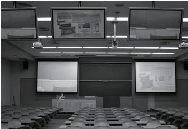
Figure 2. Overview of classroom

images of teacher computer are also displayed in the middle monitor of distant computer room. Students take classes while referring operations by the teacher. If students cannot understand the operations just referring the middle monitor, teacher can operate student computer from teacher computer.