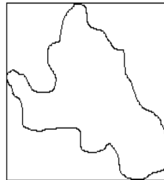
Figure 1: Minimum bounding rectangle

Let us briefly introduce the concept of object approximation and spatial indexing used for web presentation of spatial data.