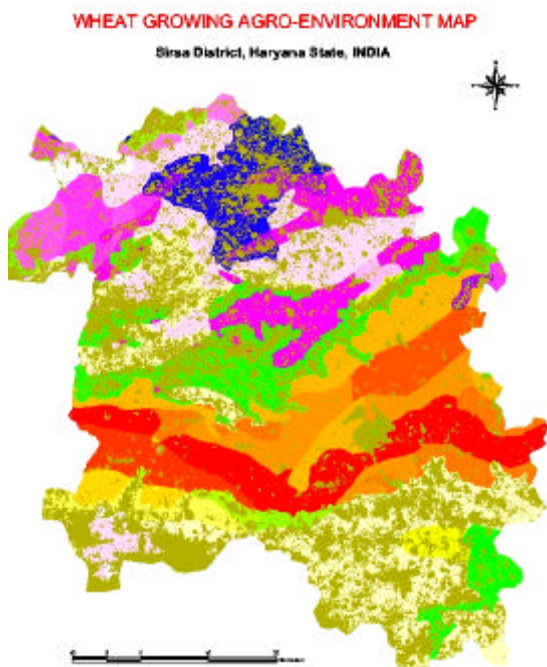
Figure 2. Spatial pattern of wheat growing agro – environment

yield. For example high vigour wheat (40-50 q/ha) has been observed on fine loamy Typic/Vertic Ustochrepts and coarse loamy Typic Ustifluvents.