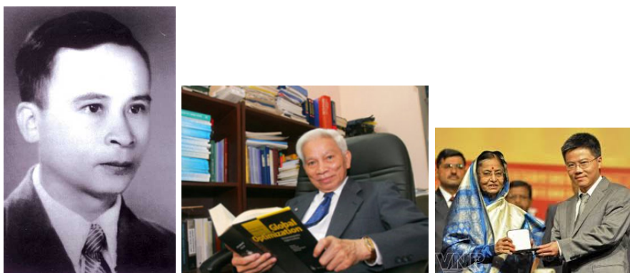
FIGURE 5. Lê Văn Thiêm (photo on left), Hoàng Tụy (center), and Ngô Bảo Châu (far right).

There is a fundamental reason why cryptography sometimes serves to level the playing field. Cryptography, like pure mathematics, is cerebral — there is no need for large capital investment. To have good cryptography, you don't need to be rich; you only need to be smart. In mathematics, even in the unimaginably difficult conditions of the French and American wars, Vietnam has had a strong tradition [12, 13, 14], as exemplified by the eminent mathematicians Lê Văn Thiêm, Hoàng Tụy, and the Fields Medalist Ngô Bảo Châu. Given the high value that Vietnamese culture places on pure thought, it is not so surprising that they were able to come up with ciphertext that the NSA could not break.