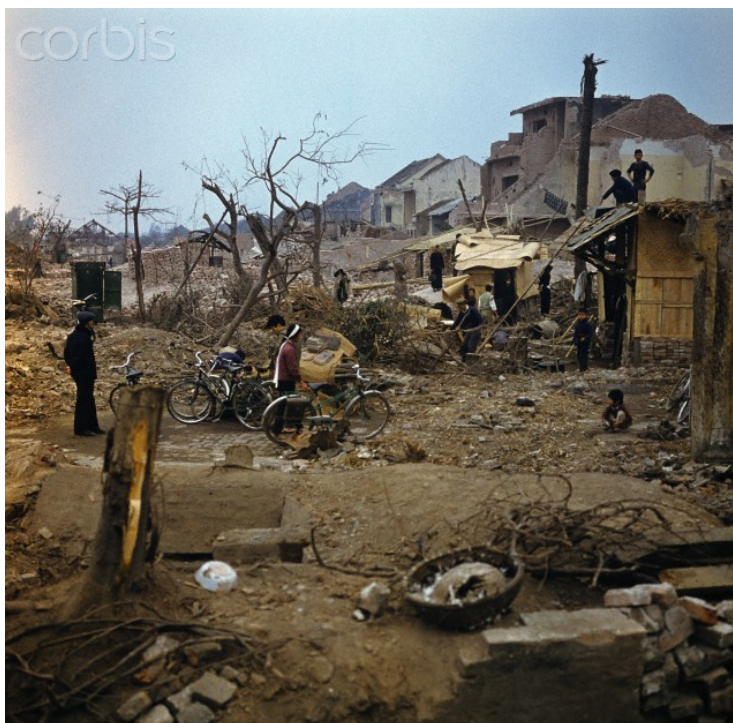
FIGURE 6. Khâm Thiên Street soon after the Christmas bombing by the U.S. Air Force. We see what Gen. Curtis LeMay meant by “bomb them back into the Stone Age.”

showed morality and courage at a moment when brutal atrocities were being committed against innocent people.