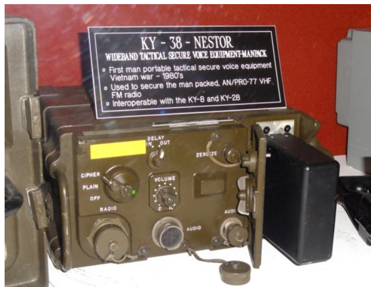
FIGURE 3. The NSA's NESTOR encryption device.

installation on 20 December 1969 that resulted in the capture of 12 cadres and large quantities of documents and communications equipment. By examining the equipment and “interrogating” (Myer’s word) the prisoners, the U.S. learned that with the help of “English linguists [who were] an integral part of Viet Cong and North Vietnamese units,” they could “monitor and exploit virtually all nonsecure voice and manual Morse code communications.” Captured documents contained “extensive instructions on proper intercept techniques and detailed analyses of the communications procedures and exploitable weaknesses of U.S. and allied units.”