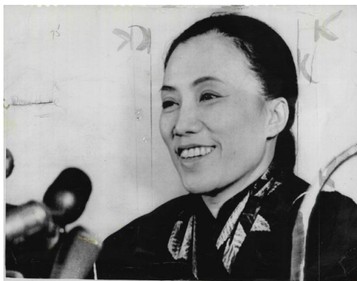
FIGURE 1. Nguyễn Thị Bình at the Paris Peace Talks in 1969.

Privacy) and John Gilmore (a founder of the Electronic Frontiers Foundation). From this optimistic point of view, crypto can be like the slingshot that the boy David used to take down the giant Goliath. And as pointed out in the above quotation of Nguyễn Thị Bình (who headed the delegation of the Provisional Revolutionary Government of South Vietnam at the Paris Peace Talks of 1969–1973), there are no better examples of a modern David-and-Goliath battle than the wars in Vietnam against the French and then the Americans.