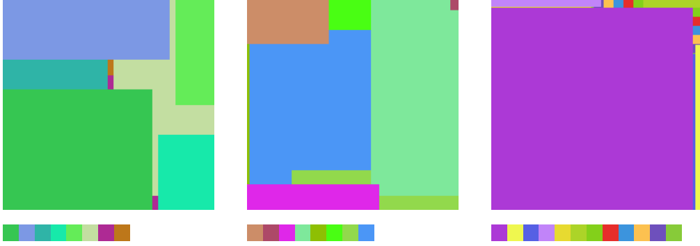
FIGURE C.1. Three examples of how transition vectors covers the I \times J plane. Each color correspond to a transition vector; below each picture, the colors are listed in the increasing order of the z -coordinate of the corresponding vector.