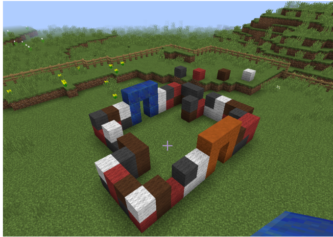
Figure 3. A completed structure viewed from the air, with some of the surrounding environment.

developed if participants reported that they could refer to at least one block type using a non-deictic method (either auditory or gestural). Participants played on two MacBook laptops which were connected by Wi-Fi. A CraftBukkit Minecraft server with customised plugins was used to manage the world and record player activity. Video and audio were also recorded for later coding.