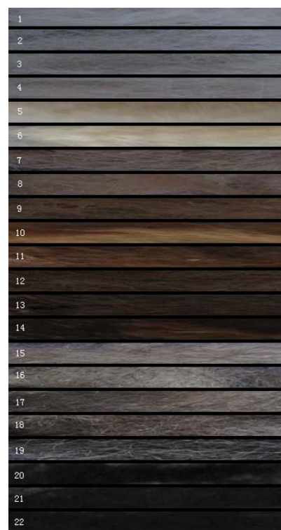
Figure 1. Twenty-two different colors of alpaca hair used in the study. 1-4 were white, 5-14 were yellow to brown, 15-19 were grey, 20-22 were black.

According to the Munsell Color System, which is the standard color measurement of fiber, 3 healthy alpacas were selected for each of the 22 different hair color phenotypes (Figure 1)(66 alpacas altogether). The Munsell color system is a color space that specifies colors based on three color dimensions: hue, value (lightness), and chroma (color purity or colorfulness): hue, measured by degrees around horizontal circles; chroma, measured radially outward from the neutral (gray) vertical axis; and value, measured vertically from 0 (black) to 10 (white). Munsell determined the spacing of colors along these dimensions by taking measurements of human visual responses. Each horizontal circle was divided by Munsell into five principal hues: Red, Yellow, Green, Blue, and Purple, along with 5 intermediate hues halfway between adjacent principal hues. Each of these 10 steps is then broken into 10 sub-steps, so that 100 hues are given integer values. Two colors of equal value and