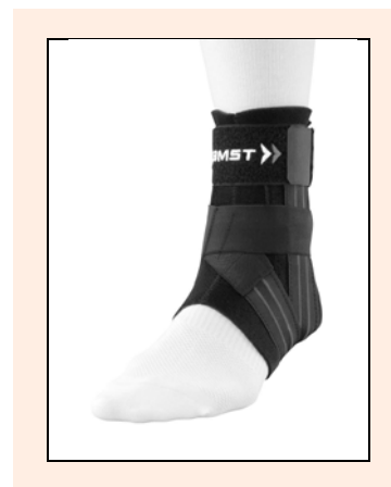
Figure 2. Semi-rigid brace (ZAMST A-1; SIGMAX Devices, Inc., Japan). Semi-rigid brace was a nylon supporter and included L-strap and Y-strap stabilizers

The participants were instructed to perform the following actions: jump in the anterior direction using a two-footed jump over the hurdle, land on the force plate on the non-dominant limb only, stabilize as quickly as possible, place their hands on their hips once they were stabilized, and remain still for 10 second while looking forward. Upper extremity movement was unrestricted during the jump but restricted after stabilization. They were allowed