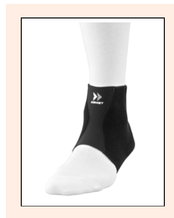
Figure 1. Soft brace (ZAMST FA-1; SIGMAX Devices, Inc., Japan). Soft brace was a nylon supporter and was designed with two layers of support for weak and swollen ankles while allowing dorsiflexion/plantar flexion.

Dynamic postural stability was evaluated using a single-leg jump landing in the anterior direction. This approach was chosen because it demonstrated good inter-session reliability: intraclass correlation ICC (3,k) was 0.86 (Wikstrom et al., 2006). Subjects positioned 40% of their body height away from the edge of the force plate, and a 30-cm hurdle was placed at the midpoint between the starting position and the force plate.