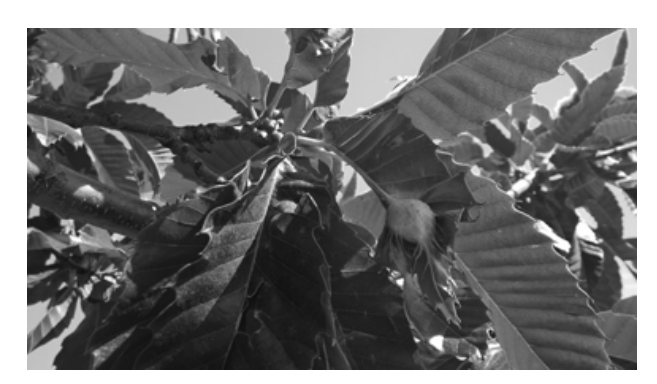
Figure 2. Simple gall of Dryocosmus kuriphilus

efficient method of controlling its present populations. The most effective method of controlling its populations and damage is the biological control with its introduced parasitoid Torymus sinensis . This organism is a univoltine, host specific parasitoid, phenologically synchronised and morphologically adapted to D. kuriphilus . It has a good dispersal ability, it builds up populations quickly and it effectively controls the pest already a few years after the release (Matošević et al. 2016). The effectiveness of this biological control strategy was confirmed in many countries where the parasitoid introduced was.