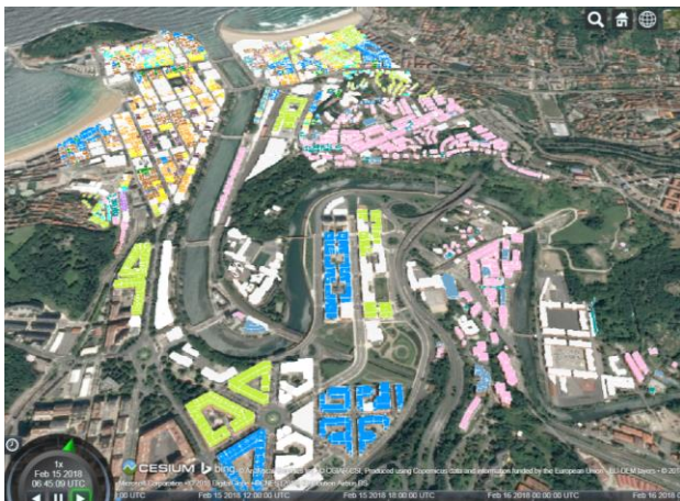
Figure 1 Building stock categorization result visualization

geographical distribution of the typologies within a 3D visualization in the building stock categorization tool.