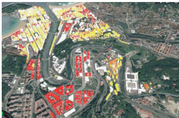
Figure 3 Building vulnerability index visualization

established, it is possible to extrapolate the result for the entire study area, giving the same value to all the buildings belonging to the same category, as can be seen in Figure 3.