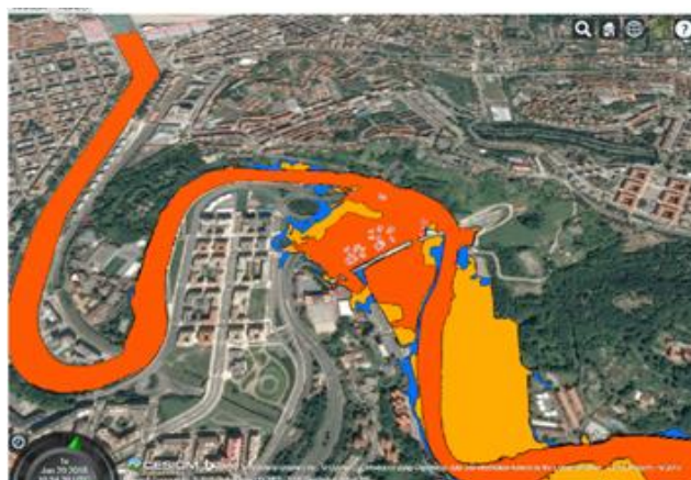
Figure 4 Flood maps visualization

As additional functionality, the tool allows also the visualization of different flood maps using WMS services, as can be seen in Figure 4.