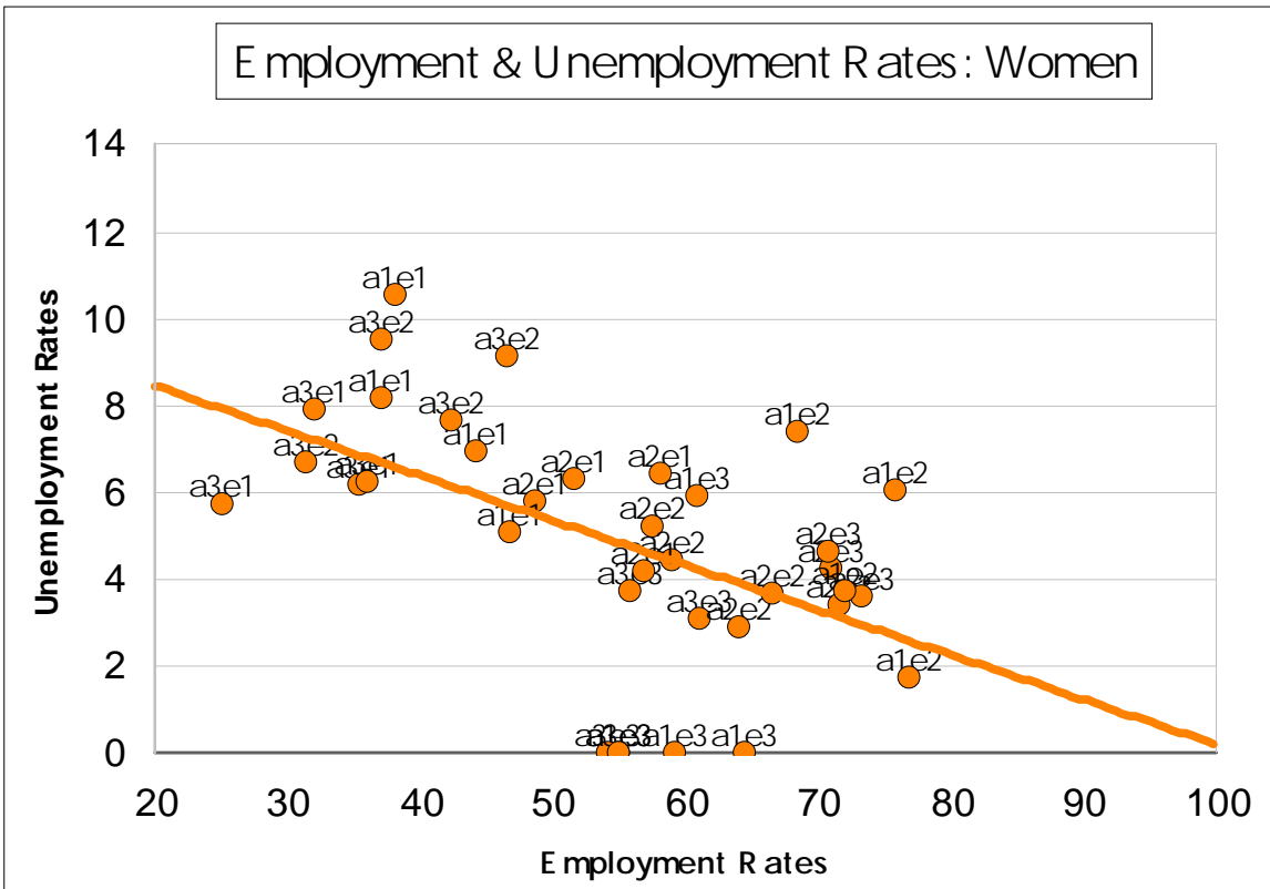
Figure 2: Employment vs. Unemployment Rates Across Demographic Groups